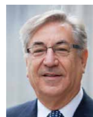
KARMENU VELLA EU Commissioner for the Environment, European Commission