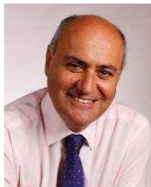
JOSÉ HERRERA Minister for the Sustainable Development, the Environment and Climate Change