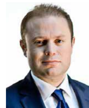
JOSEPH MUSCAT Prime Minister of Malta